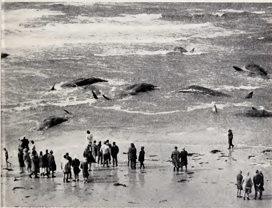
Fig. 1. Ten Sperm Whales, still alive two hours after their stranding.

One Sperm Whale only, a very old female, showed any sign of disease, which resembled a severe kind of eczema; the skin around the eyes, mouth, vent and mam-